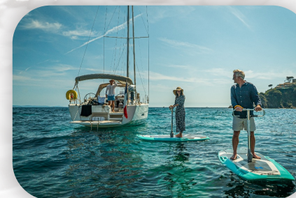
Moderate speed of 7km/h forward & reverse, Easy maintenance 'Plug & Go'