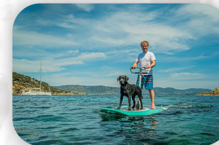
100% electric, 0% emission, Board is made out of 100% recyclable HDPE