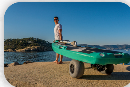
Foldable handlebar Easy to tow and store on land