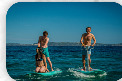
Carrying up to 3 people (max. 150 kg) Silent, 100% electric, 0% emission