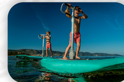
Stable & solid, Accessible to all Family Activity from 5-85 years old